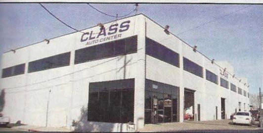
Class Auto Center in Long Beach