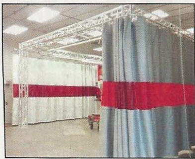
The aluminum room at Class Auto Center in Long Beach

Class Auto Center proudly has earned Manufacturer Certification from Mercedes Benz, Audi, Porsche and a special Certification for the Nissan GT-